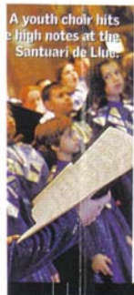
A youth choir hits high notes at the Santuari de Lluç.

ecology sim- ion. hic glass n is ster- - y is s, a archi- icho,